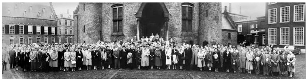
Friends of CRC Image 15-7015

This panoramic framed image was found during the 2012 clean-up at CRC. The Board has examined it extensively, and can recognize nobody!