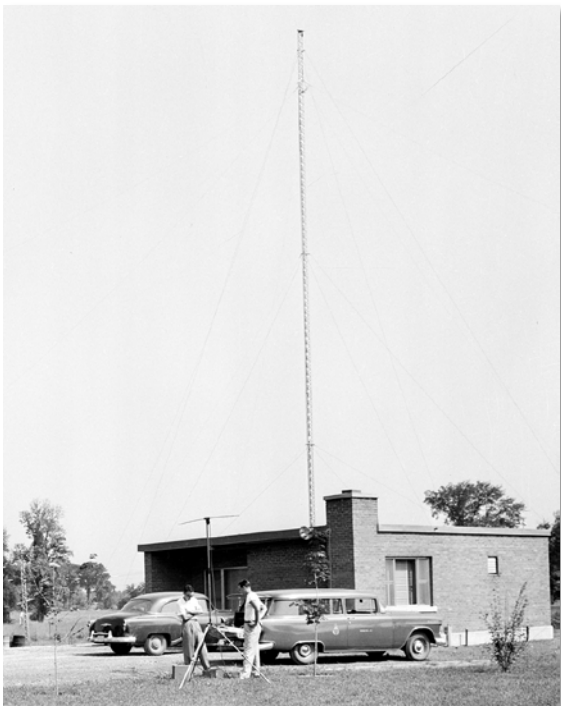
Bldg. 67 with unidentified researchers in 1956, CRC Image 56-RPL-0642

http://www.youtube.com/watch?v=h5WFqg6px4